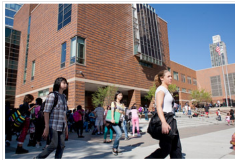
Students and faculty leave the Ogden International School of Chicago, Monday, Aug. 27

Ogden — a community school that enrolls students from the Near North Side, New Eastside, the Gold Coast, Streeterville and River North — has long since locked down its teachers and faculty. But the mother and her legal team say evidence surrounding that phone call paints a disturbing picture.